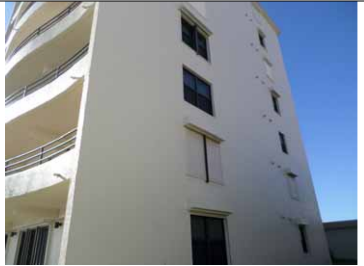
Exterior walls / Partial shutters